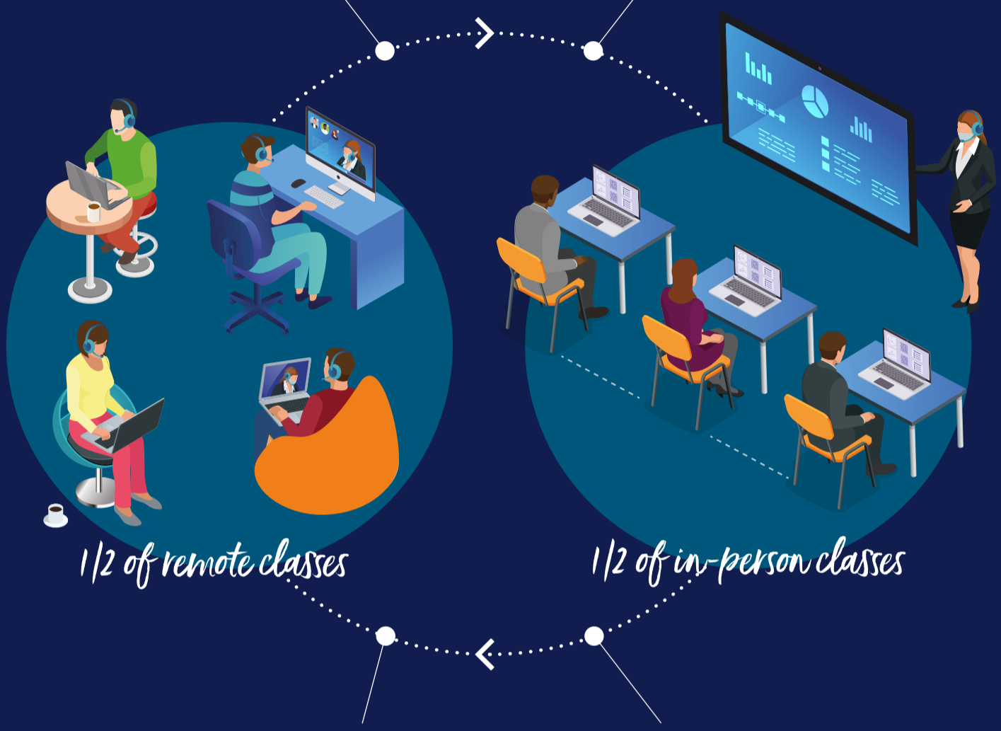
1/2 of remote classes

1/2 of in-person classes, remaining 1/2 of remote classes.